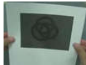
Animated Optical Illusion! (video) by signalred