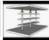
Zero Point Shelf by mada