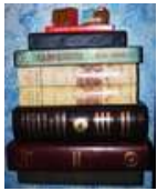
The Invisible Bookshelf (slideshow) by lukethebook333