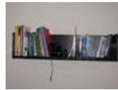
How to build wall mounted bookshelves for less than $100 by kabira