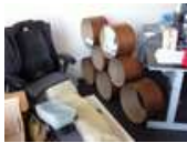
Tube Shelves (slideshow) by nagutron